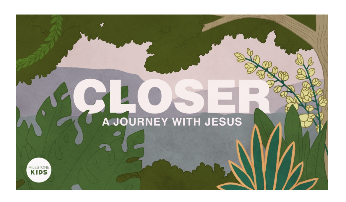
WEEK 4: I'M CLOSE TO GOD WHEN I WORSHIP JESUS

Mark 12:30 "Love the Lord your God with all your heart, with all your soul, with all your mind, and with all your strength."