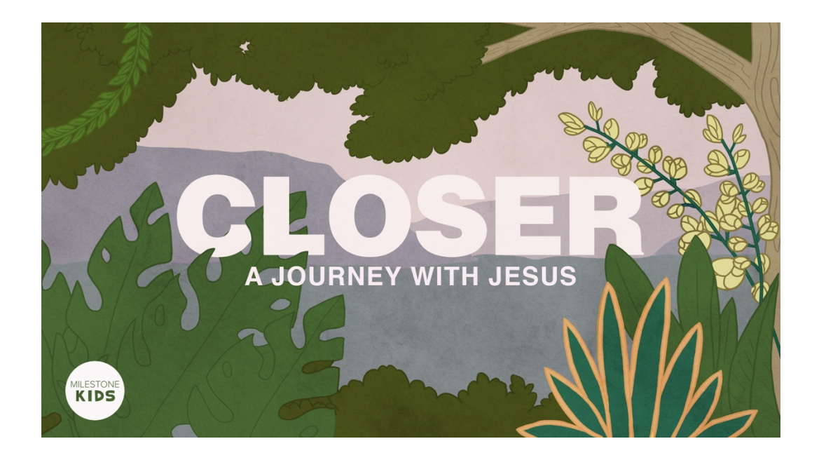
WEEK 3: I'M CLOSE TO GOD WHEN I LOVE LIKE JESUS 1 John 4:11 "Dear friends, since God so loved us, we also ought to love one another."